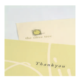
Pharaoh Stationery 120gsm subtle cream. 250 from £60.30 STPHICSOD