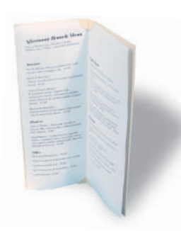
Menu Grips 250 from £351.90 MEGA4?