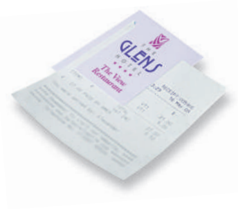
Receipt Clips 250 from £72 RCLIP?