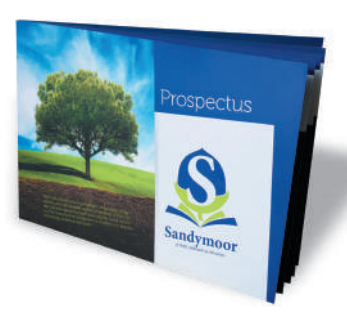
Landscape A4 297x210mm pages