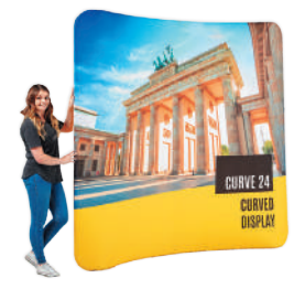
Curve 24 2.4m wide curved stand from £325 FDSBLOFC