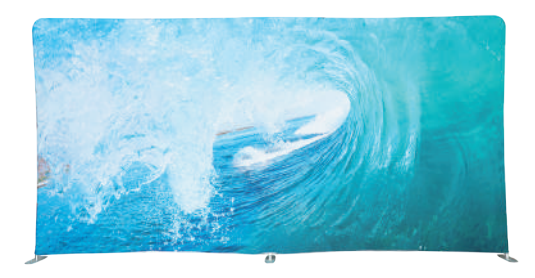
Stage 18 1.8m wide straight stand from £305 FDSCHOFC

Stage 46 4.6m wide straight stand from £659 FDSSA0FC