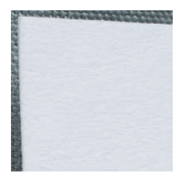
Conqueror Stationery 120gsm Stonemarque texture. 250 from £63 stcacsdd