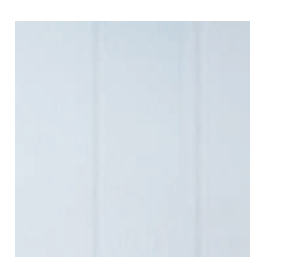
Praxis Stationery 100gsm Micro-laid texture. 250 from £59.40 stprcsod