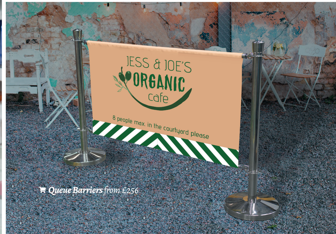
🛒 Queue Barriers from £256