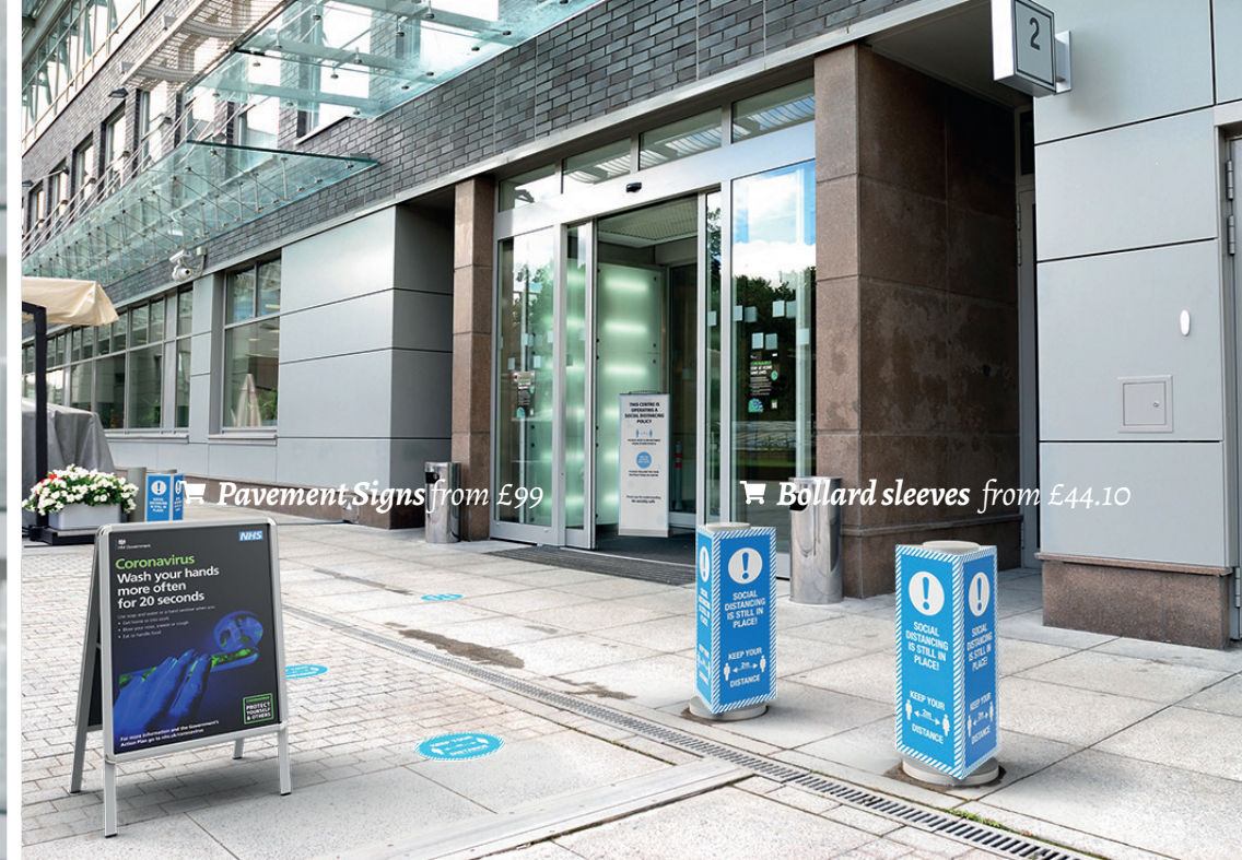
🛒 Pavement Signs from £99