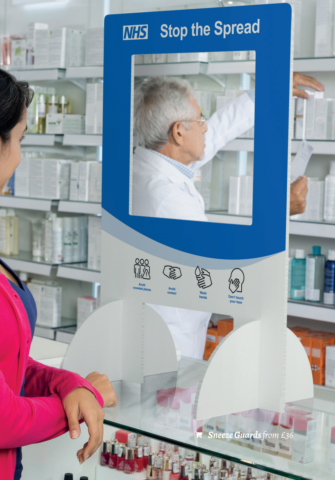
🛒 Sneeze Guards from £36